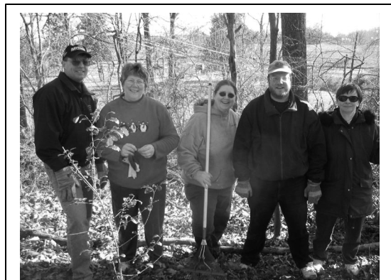
"Come join us! Garden work is fun!"